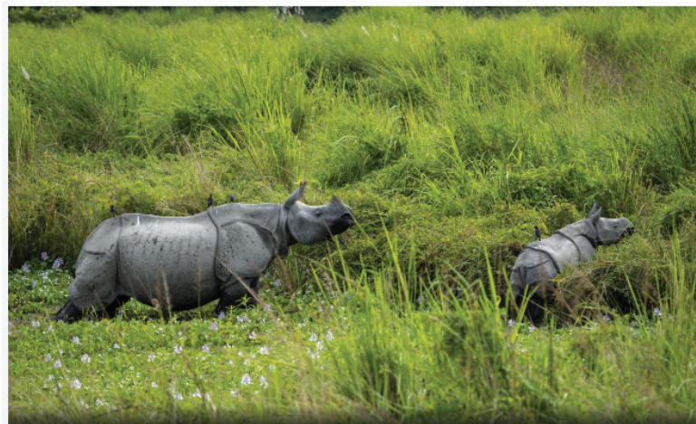
Rhino horns are shrinking due to the impact of hunting.