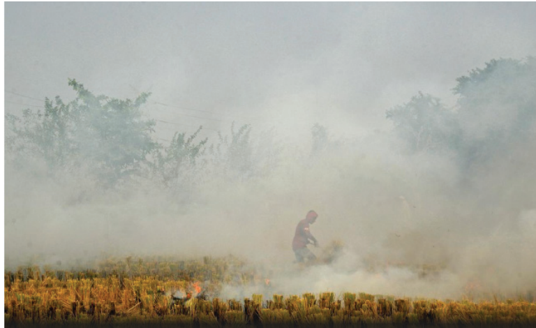
Capital of India chokes (November 4, 2022).